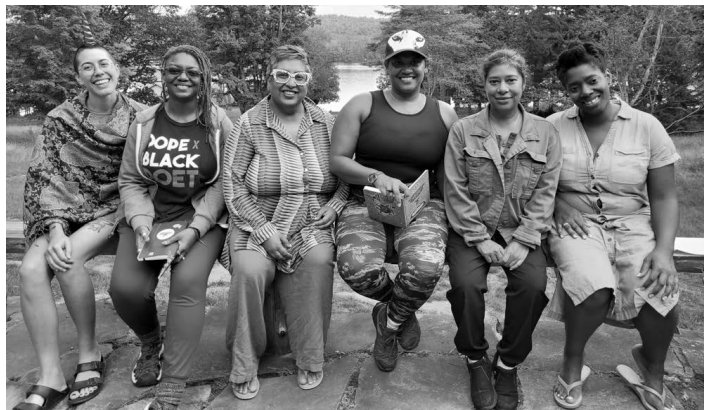
Changemaker Authors on the front porch.

Word Up Summit convened members of Word Up Community Bookshop/Librería Comunitaria, a multilingual, collectively operated bookshop and arts space in Washington Heights. The collective hosts an annual Summit, gathering to define collective structure, examine threats, make plans to mitigate challenges and do consensus training. This year they hosted the summit at BMC to examine sustainability strategies, reset priorities, update their mission and discuss how to hold joy amidst it all.