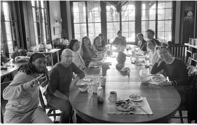
Session 3 enjoying a sunny breakfast.