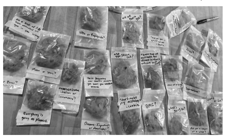
Affirmative cookies for journeys ahead.