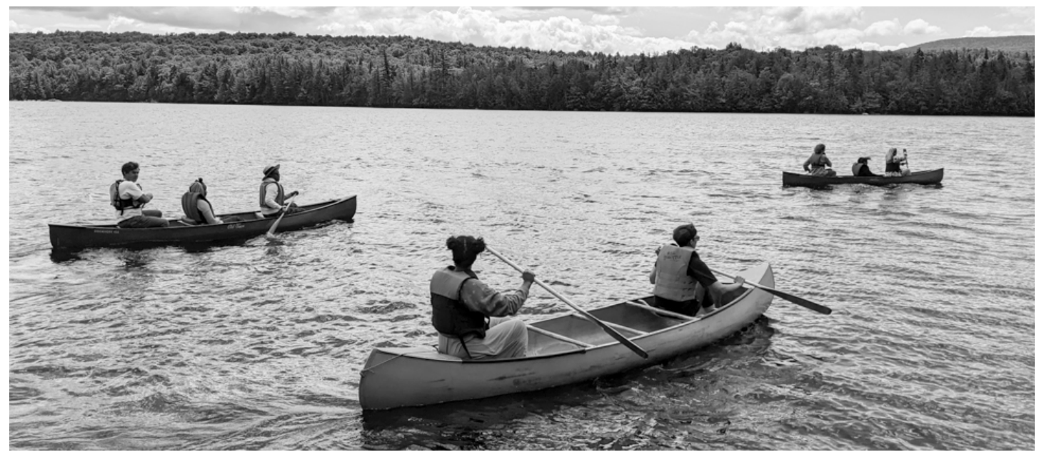
Session 1 encounter choppy Eagle Lake waters.

Blue Mountain Center's Community Newsletter • December 2021